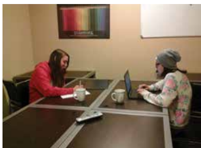
Student STUDY ROOM