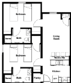
2 BEDROOM SUITE