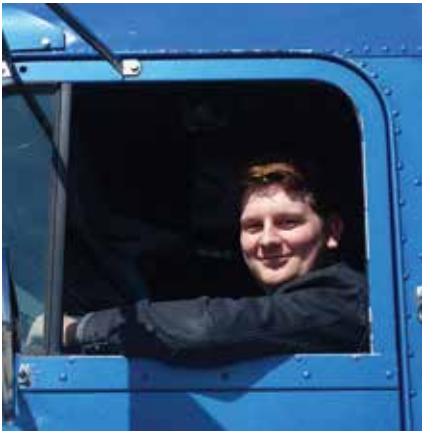
This young man got the chance to see how it felt to drive a BIG truck during the College's annual 10th Grade Career Day.