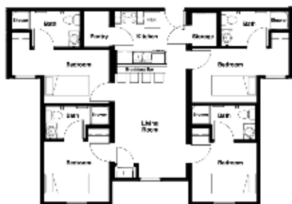
4 BEDROOM SUITE