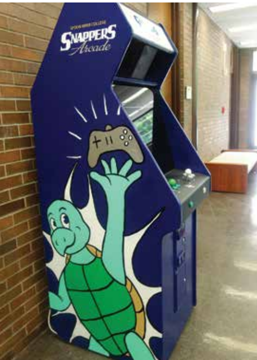
The completed Snappers Arcade game once the CIS class was finished building it, and Tracy Snowman's art students were finished painting it.