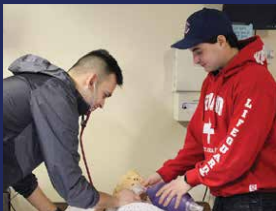
Two EMT students demonstrate providing breaths to a non-breathing manikin.

To learn more, check out a course schedule at www.src.edu . You can also contact an advisor at 309-833-6069 (Macomb) or 309-649-6400 (Canton) and ask about EMT classes.