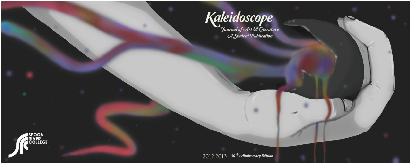
Third Place Cover Design by Kelsey Peace